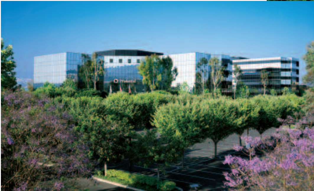
17700 Castleton Street