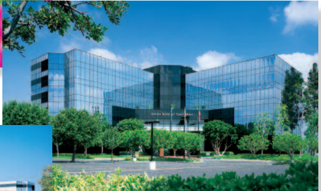
17800 Castleton Street