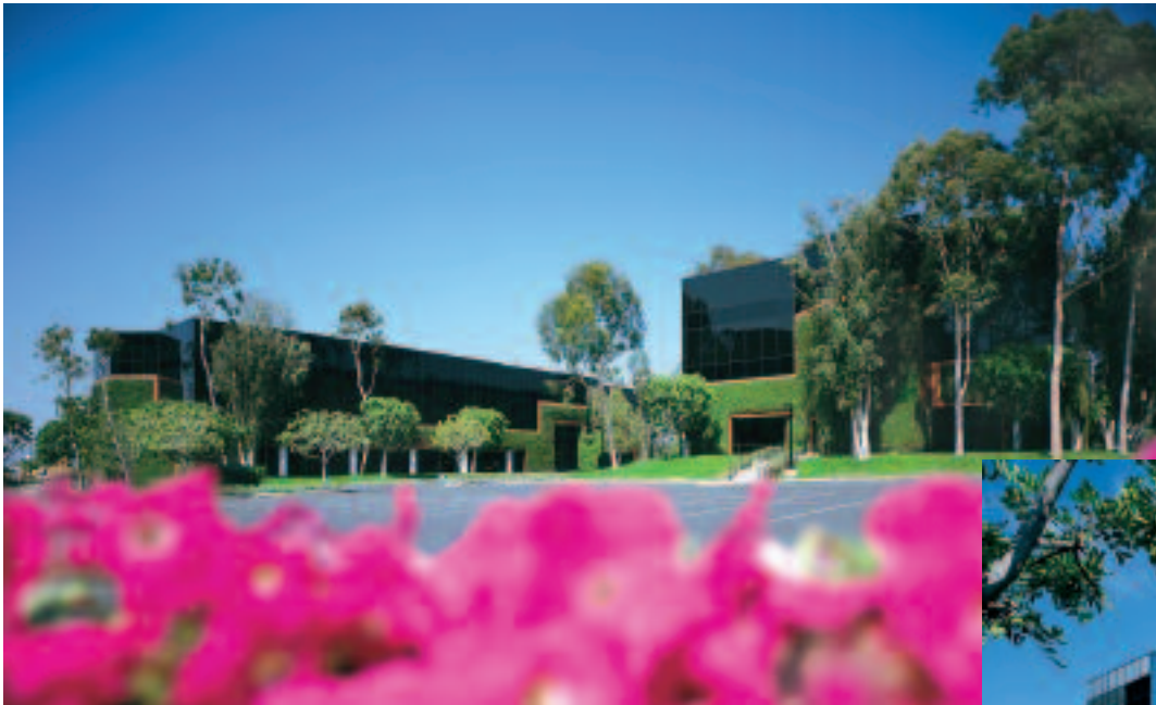
17870 / 17890 Castleton Street